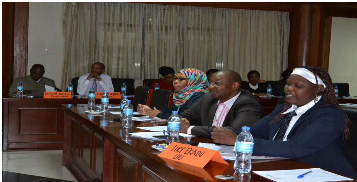
Picture 1: Participants follow the proceedings during the conference

In recent years, Tanzania has had some incidences indicating that the culture of political and religious tolerance is fading away amid threats to the media fraternity where members of the press have been under siege while on duty. The past three years have seen several journalists injured, with one killed while on duties by law enforcing organs. Thus, the session came timely ahead of the General elections slated for October 2015.