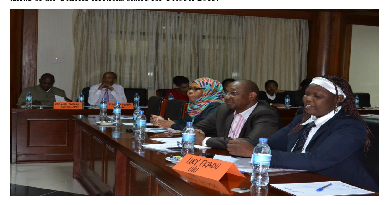
Picture 1: Participants follow the proceedings during the conference

In recent years, Tanzania has had some incidences indicating that the culture of political and religious tolerance is fading away amid threats to the media fraternity where members of the press have been under siege while on duty. The past three years have seen several journalists injured, with one killed while on duties by law enforcing organs. Thus, the session came timely ahead of the General elections slated for October 2015.